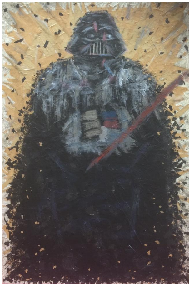
5 th Grade Art available for bid at the Fidalgo Dinner Auction

Fidalgo Elementary School 13590 Gibraltar Road - Anacortes, WA 98221 (360)293-9545