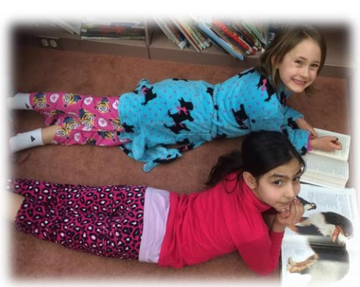
I Love to Read Pajama Day Read-In in the Library